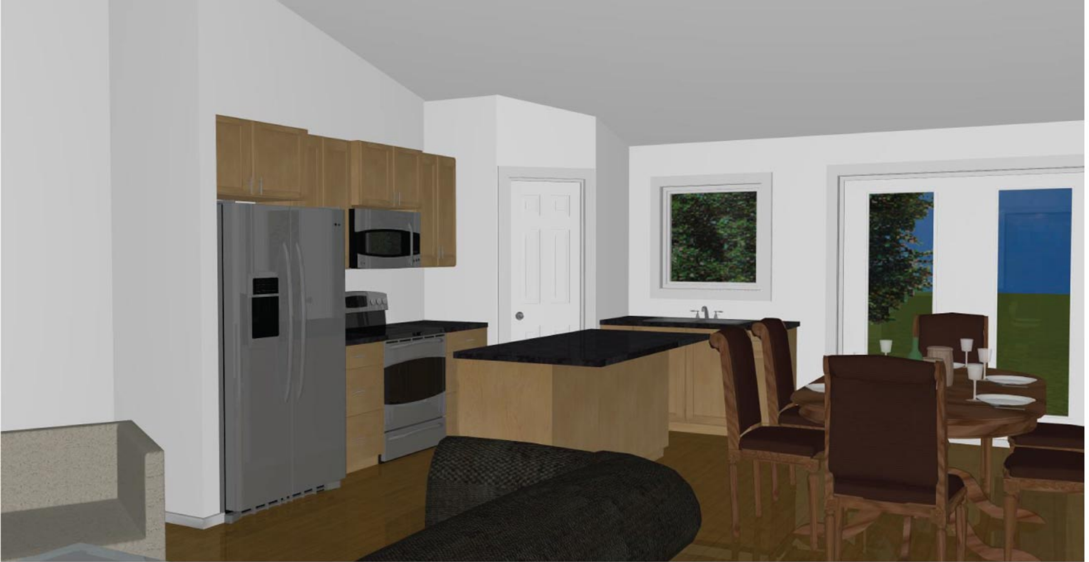
KITCHEN CROSS SECTION