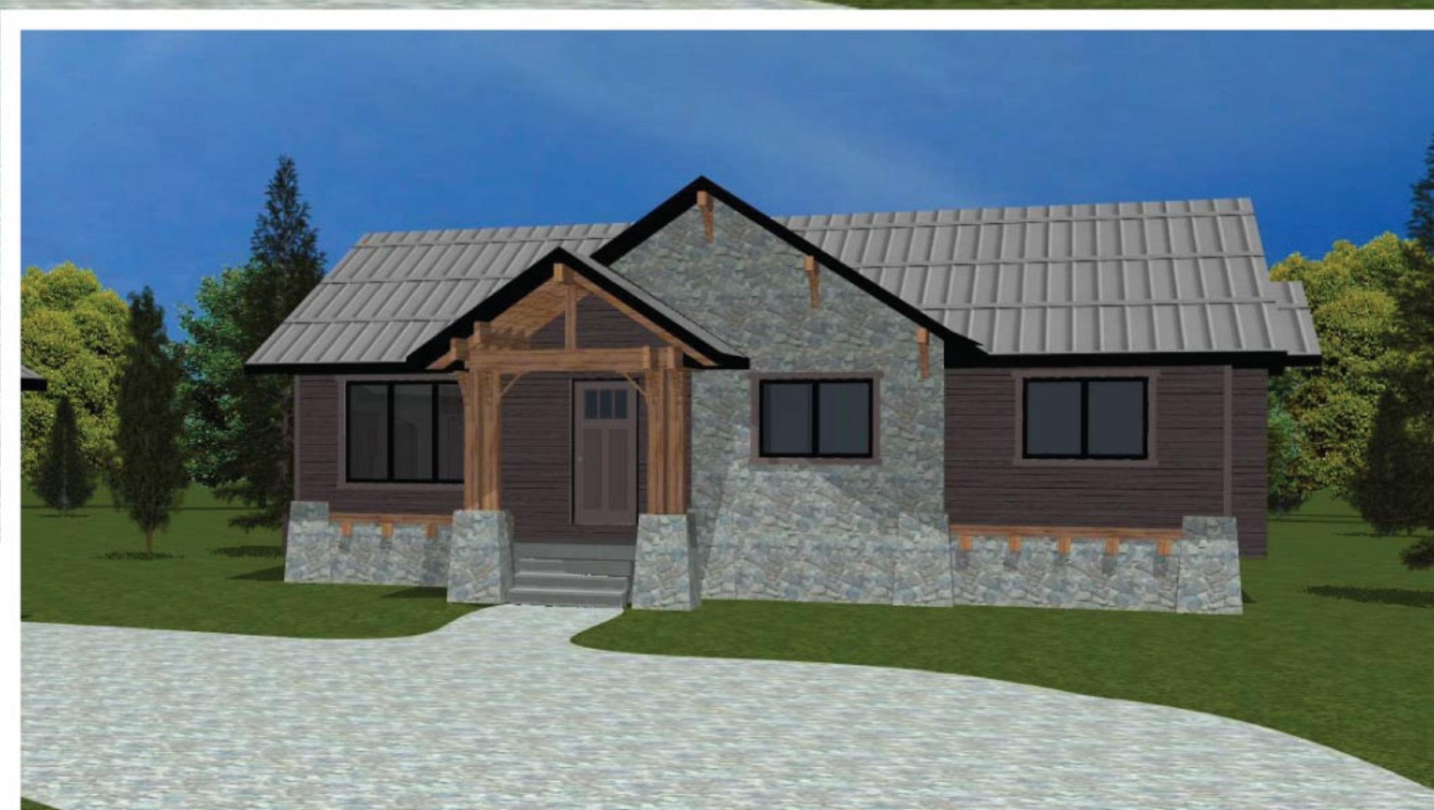
METAL ROOF OPTION