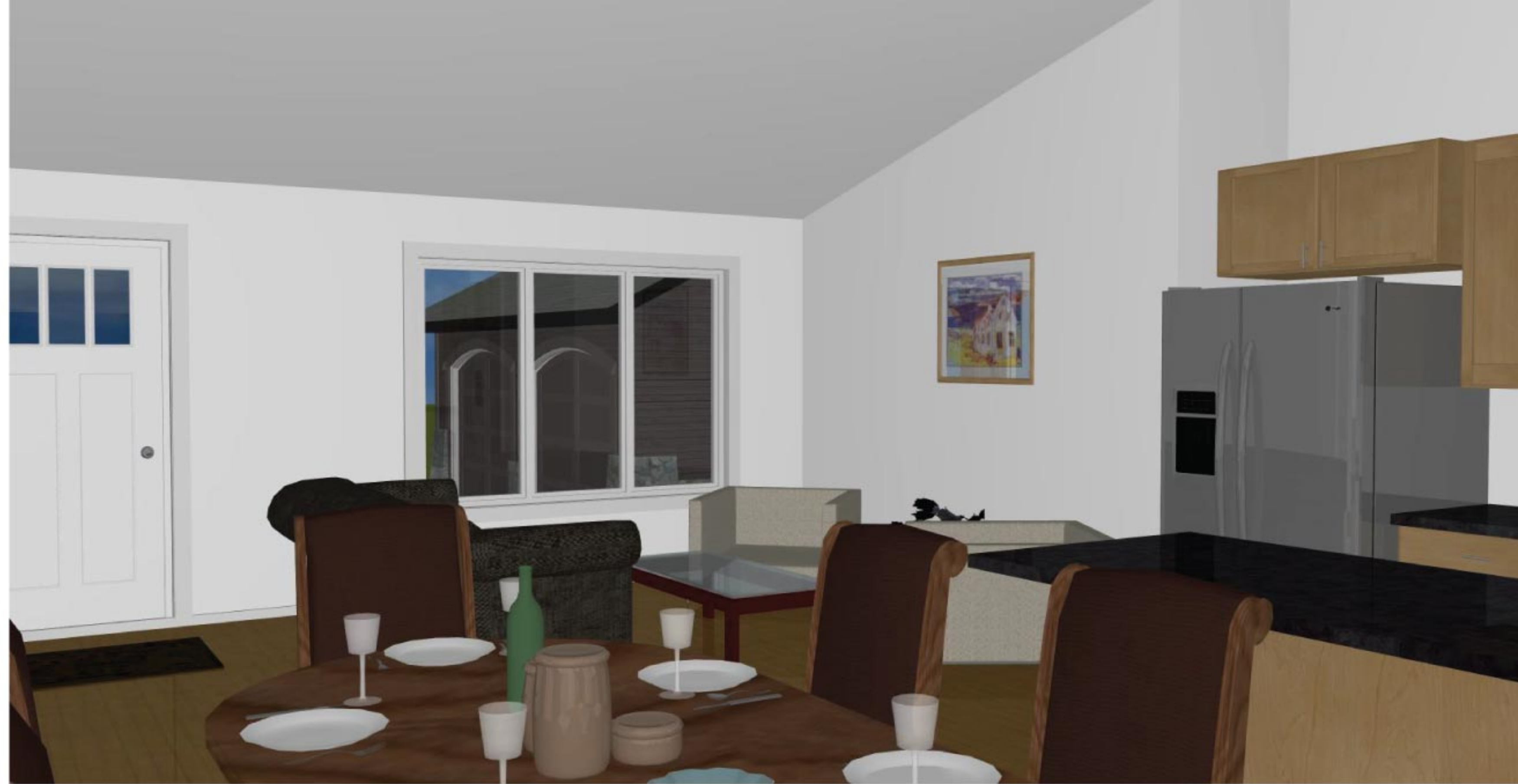
LIVING ROOM CROSS SECTION